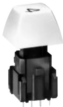
SD Grid Plate Mount