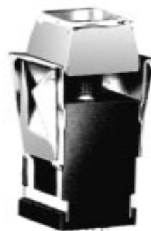
SN Snap-in Panel Mount