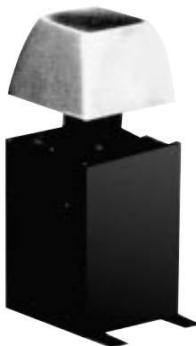
SN PC Board Mount

SD modules have a lower profile than SN. They securely mount in a metal grid plate which provides support and enhances good keytop alignment between stations and rows. Request Product Sheet 84-02505.